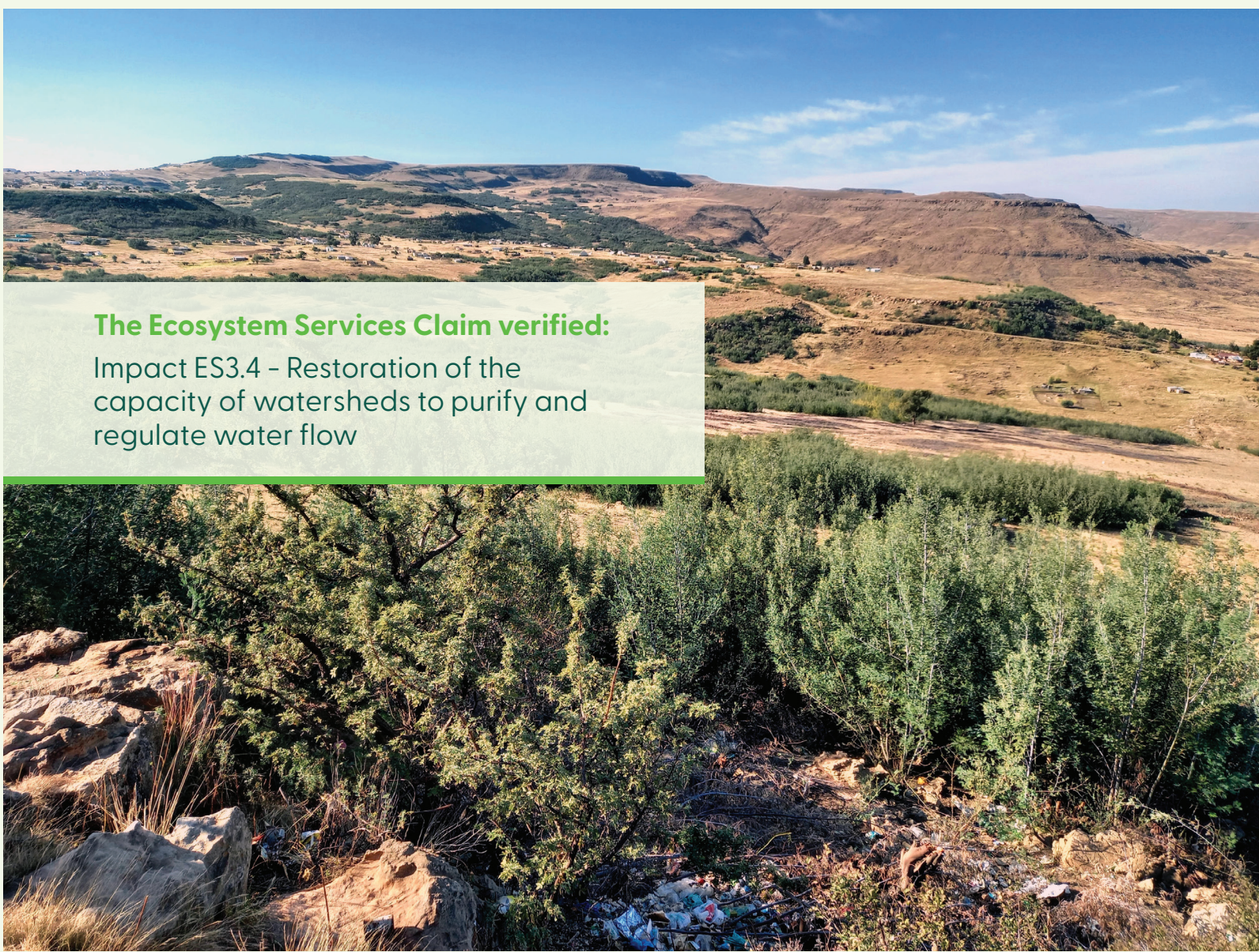
Millions of hectares in South Africa are covered by invasive tree and shrub species.

In 2021, FSC certificate holder - CMO Logistics (Pty) Ltd (FSC-C150700), had their forest management area in the greater Matatiele area and in the lower Breede River area in South Africa verified for watershed services. These areas form part of the Berg and Breede River catchments.