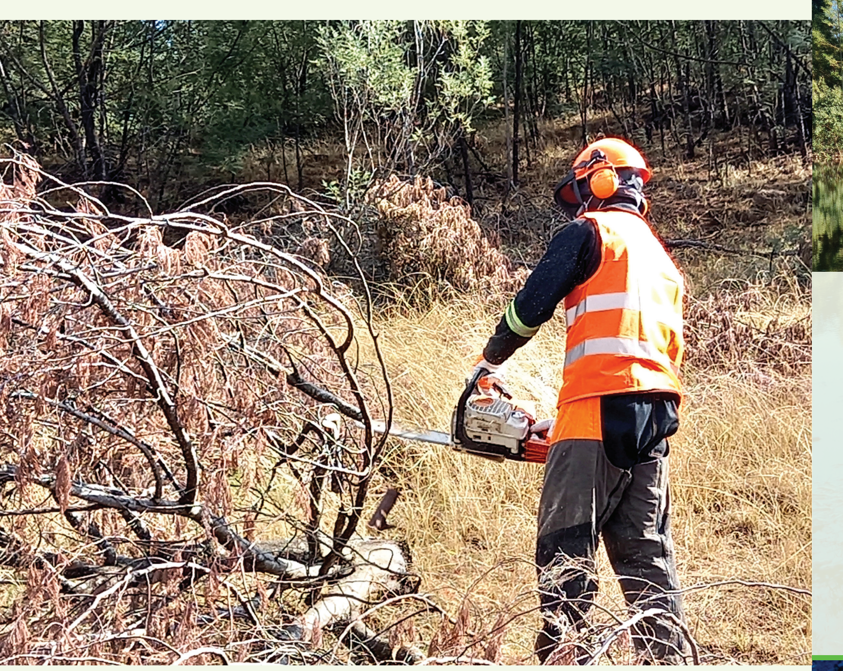
Clearing of invasive species by harvesting teams in the Matatiele area

The certification process has involved the use of best available information, creation and application of scientific methodologies, engagement with stakeholders, including the scientific community, to ensure a credible and robust methodology for the calculation of the positive impacts. As mentioned above, this was verified by an independent accredited certification body.